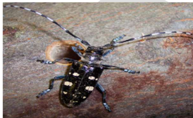
Asian Long Horned Beetle

A canker stain of plane, present in France where it is devastating plane stocks and landmarks.