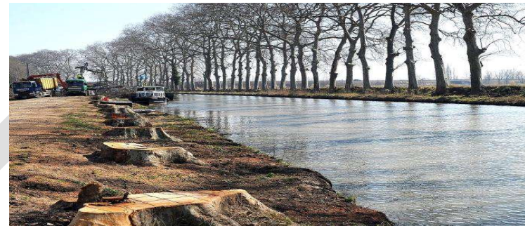
Canal Du Midi, France