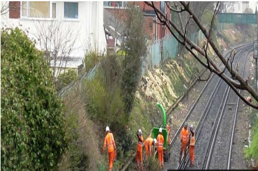
Clearance of trees on track embankment

2.8.2 Many trees in Swansea are on Network Rail land. Network Rail are undertaking a programme of removing trees within falling distance of tracks which will result in millions of trees being removed throughout the UK. The Council will work with Network Rail as it fells trees across the County to ensure tree replanting initiatives offset the biodiversity loss arising.